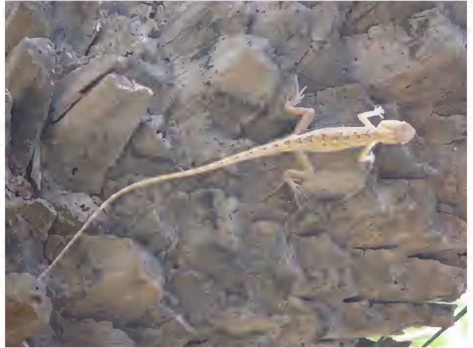
Fig. 2H. Indian Garden Lizard Calotes versicolor .